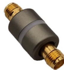
DC-Block Aluminum casing with isolation ring