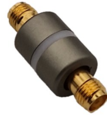
DC-Block Aluminum casing with isolation ring